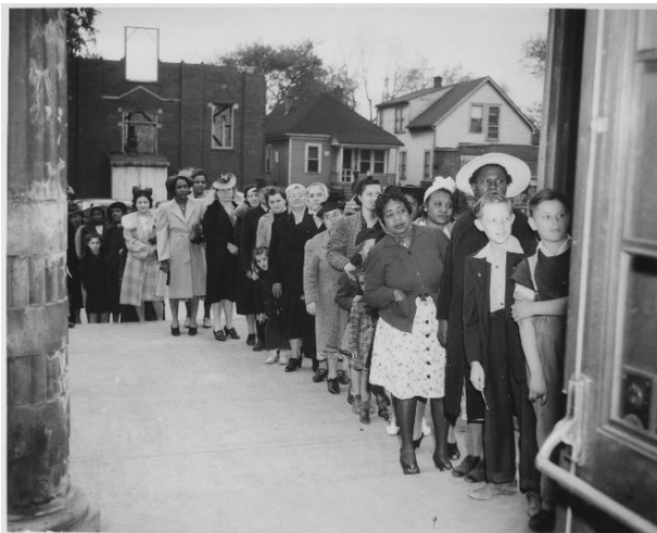
A line for sugar rationing during WWII.

Remember, nothing is rationed in 2016. Bid on auction items to your heart’s content!